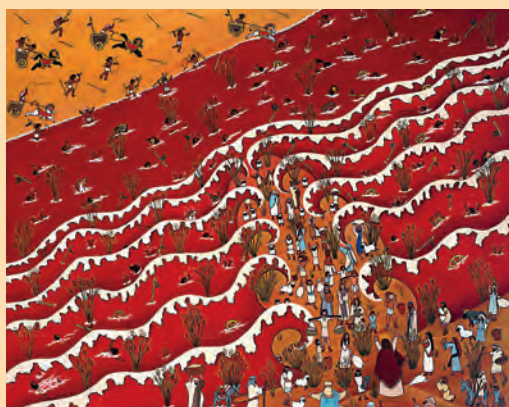
The Parting of the Red Sea