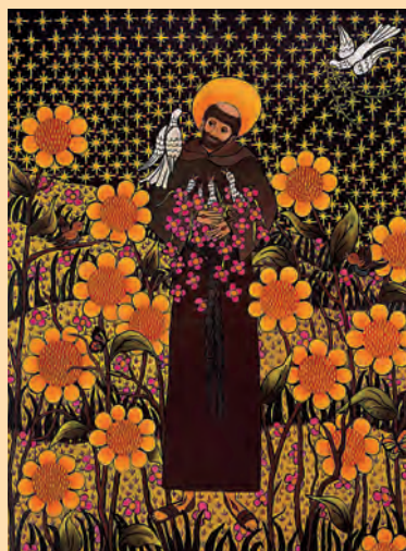
St. Francis of Assisi