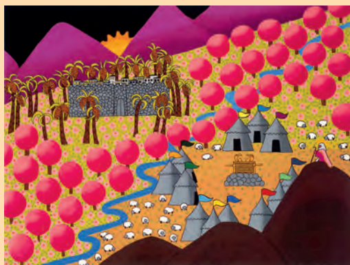
The Promised Land