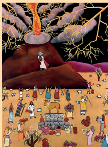
Moses' Descent from Mt. Sinai

Gallery 121 S. Water Street Henderson Nevada 89015